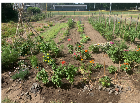
Views of Grove Street Garden.

Bronze Certification lasts for three years, during which time the town will work toward Silver Certification.