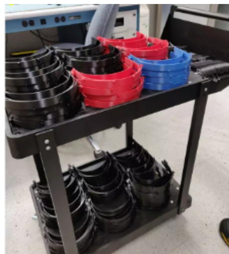
3D-printed face shields.

Ahlstrom-Munksjö's plant in Windsor Locks originally opened as the Dexter Company in 1767 - when the Locks was still a British Colony.